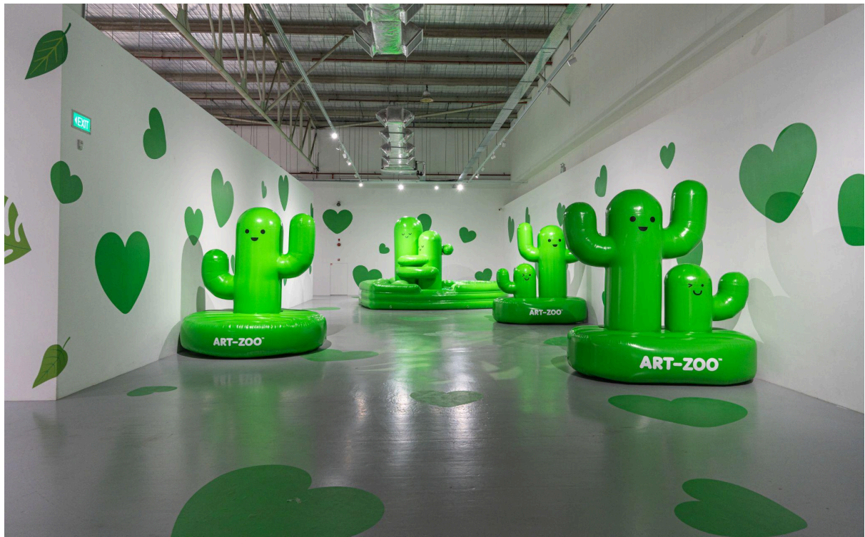
ART-ZOO, Canyon of Cuddles (2025) Installation

The Canyon of Cuddles by ART-ZOO, is an exciting and vibrant inflatable art playground experience designed by Singaporean artist Jackson Tan, featuring towering inflatable cacti, colourful landscapes, and a fun ball pit. This unique combination of creation encourages active play, creativity and exploration in a safe and engaging environment.