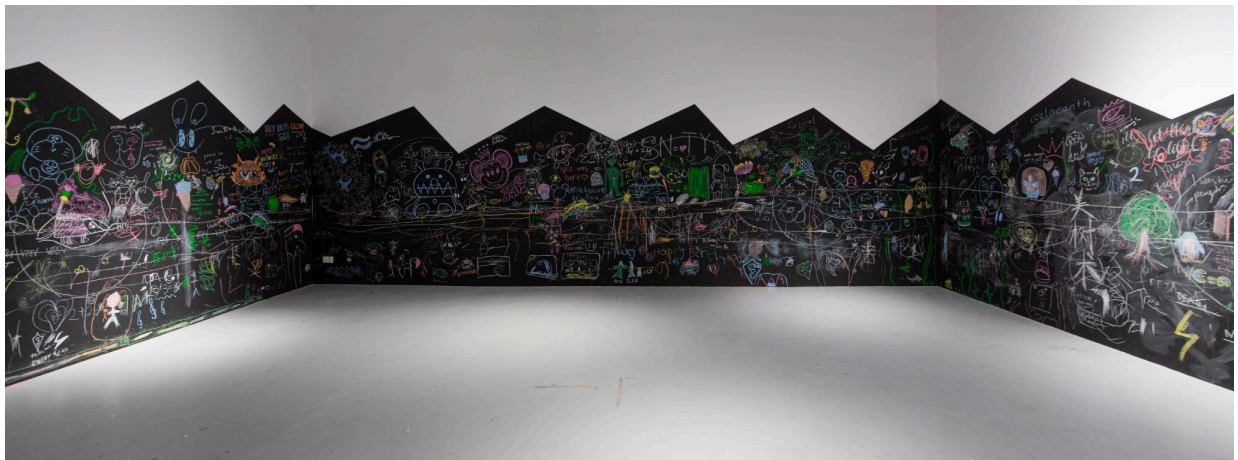
Imagination Room Installation

The Imagination Room is a uniquely immersive space designed to inspire creativity and self-expression. Visitors will be enveloped by the rich, deep black walls, creating a striking backdrop that invites imagination to flourish. It is designed to foster a sense of community and shared creativity. This is not just a room; it's a canvas awaiting your personal touch. Whether you choose to sketch intricate designs, jot down inspiring quotes, or collaborate with fellow visitors, the possibilities are endless. Embrace the opportunity to express yourself and witness the beauty of collective imagination unfold before your eyes.